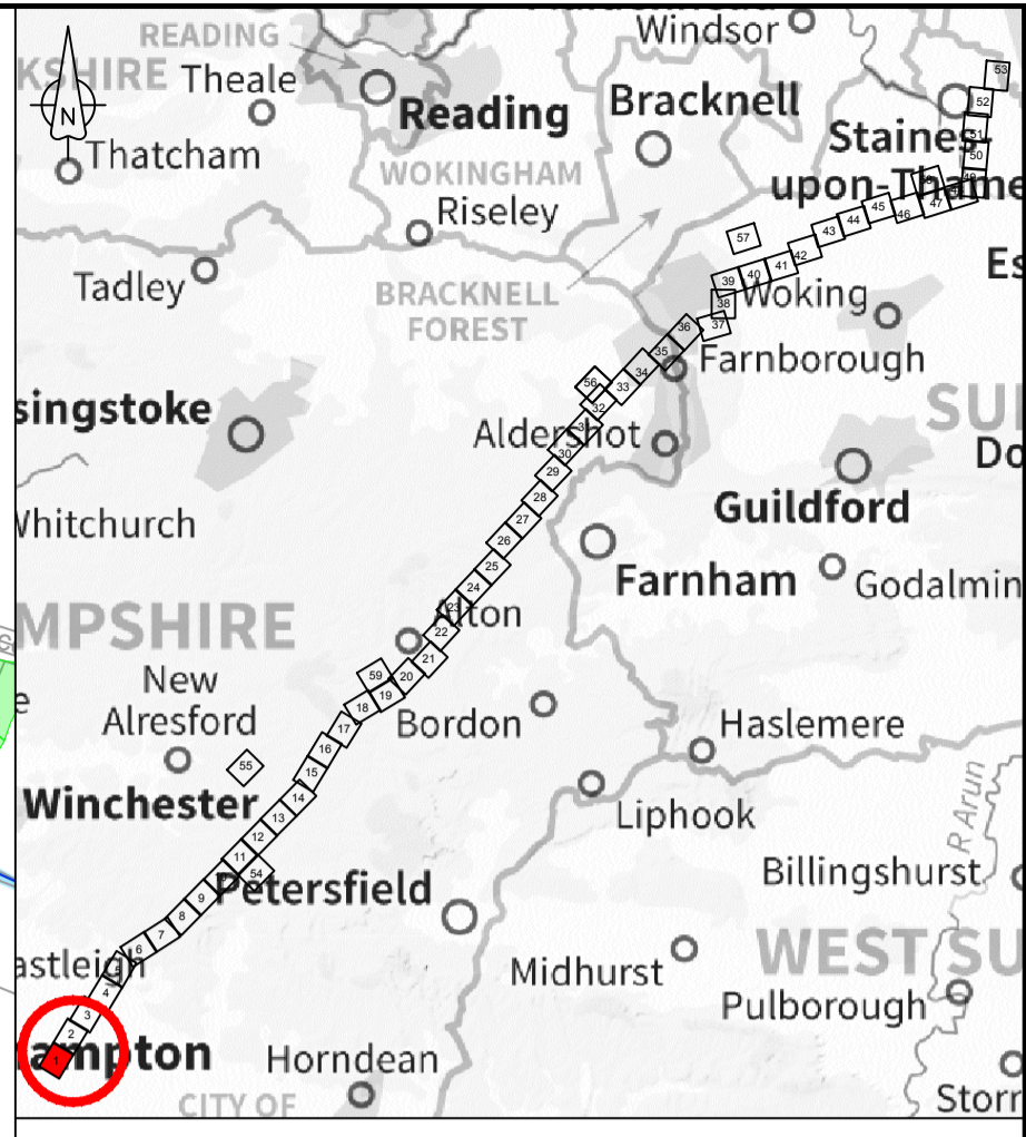
LOCATION PLAN SCALE 1:500,000