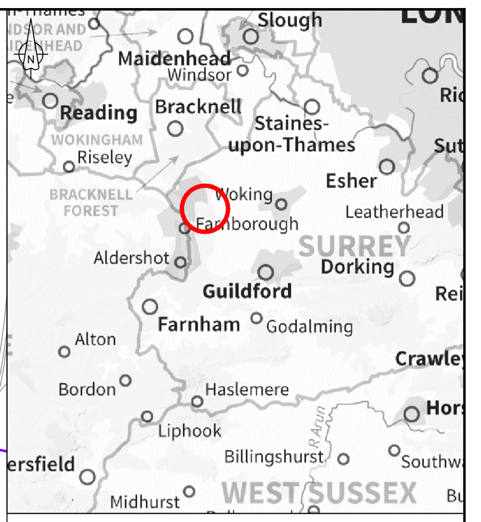
LOCATION PLAN SCALE 1:500,000